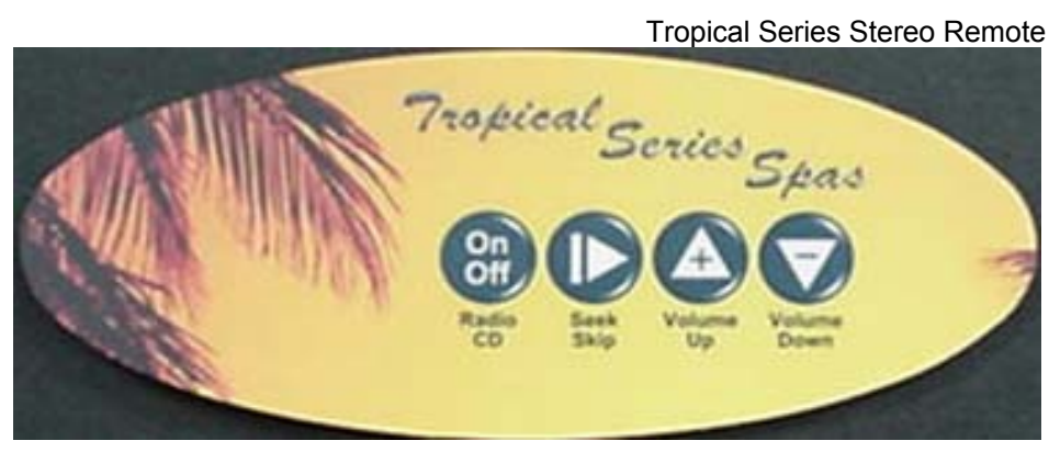
HOW TO USE THE STEREO SPA SIDE CONTROL

On/Off (Radio/CD) The first press on the Radio/CD key will turn on the stereo radio. Once the stereo has been turned on, this key is used to toggle between the Radio or CD mode. To turn the stereo off, press the same key for more than 5 seconds.