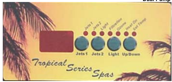
Dual Pump Tropical Control System