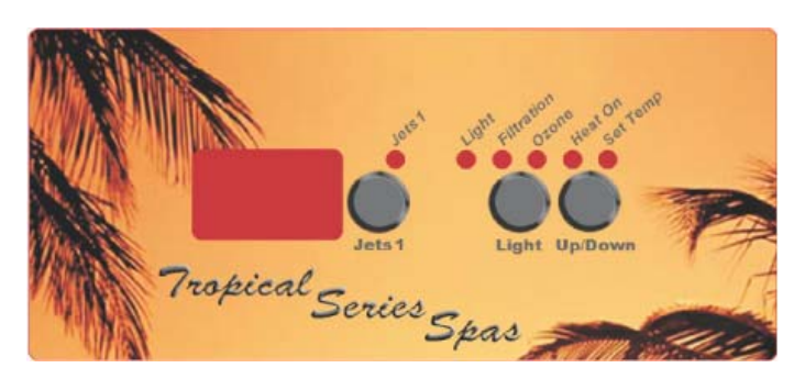
Dual Pump TSC-18 Tropical Control System